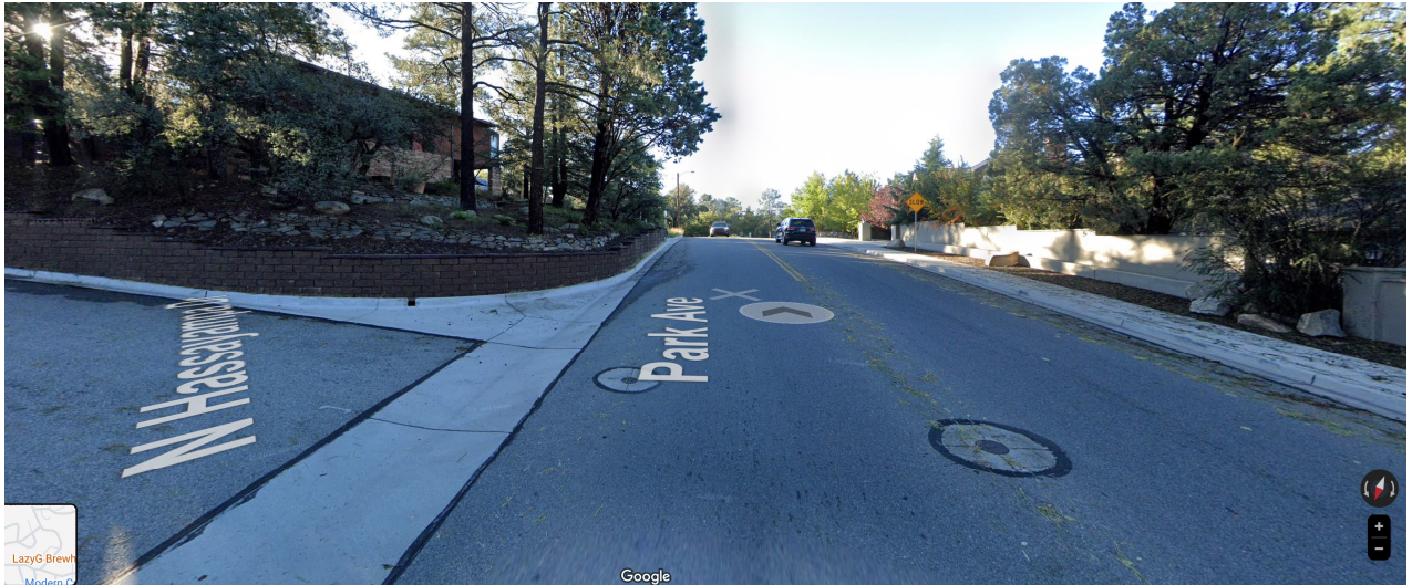
SB Park Ave. near N. Hassayamapa Dr.