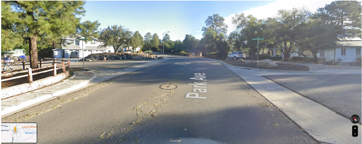
NB Park Ave. near Seirra Preita