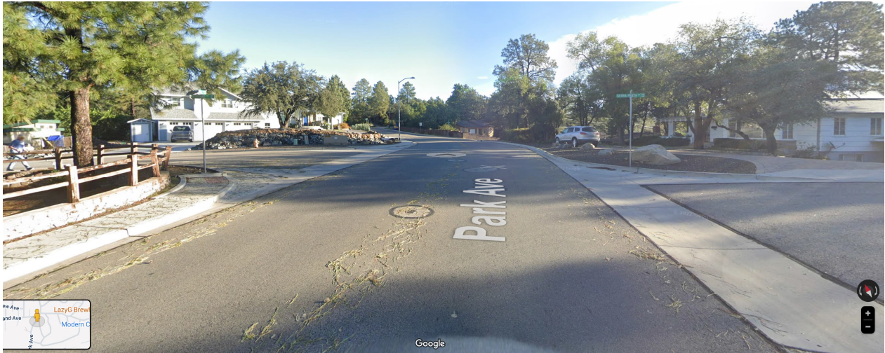
NB Park Ave. near Seirra Preita