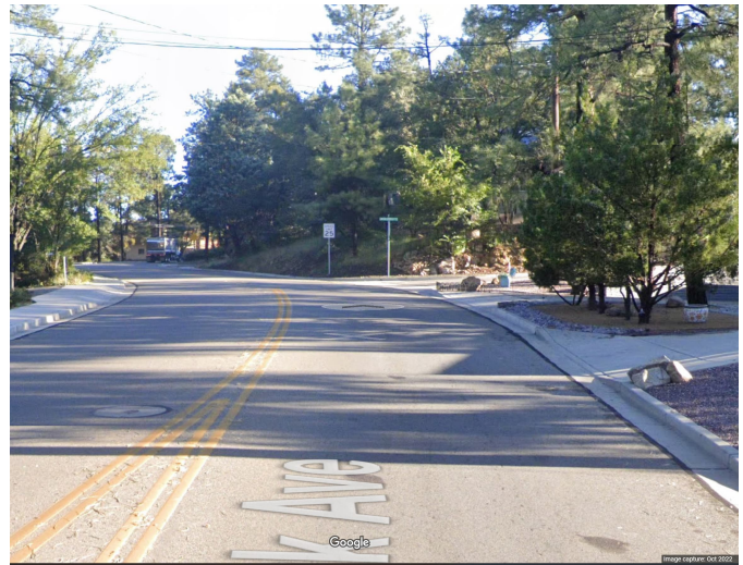
Heading NB from Copper Basin Road