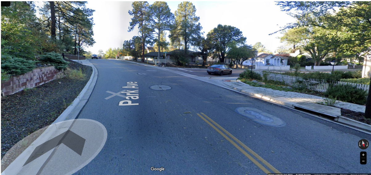
SB Park Ave. near Country Club Drive