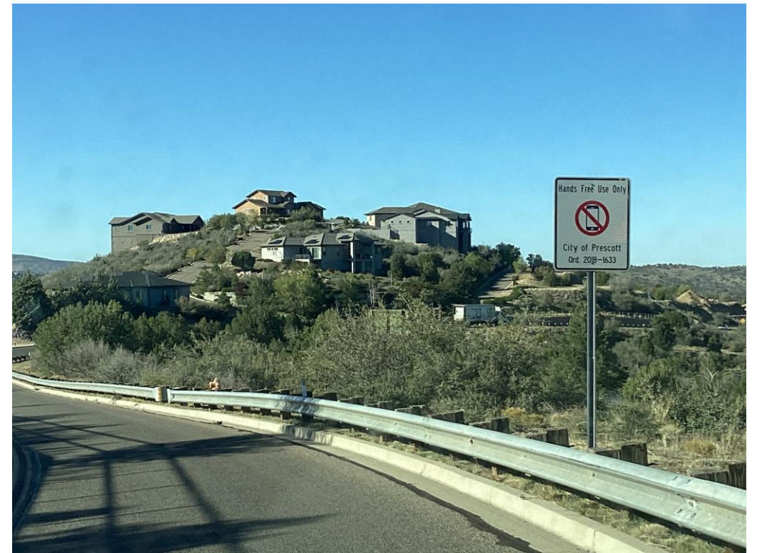
Hands Free sign on Senator Hwy.