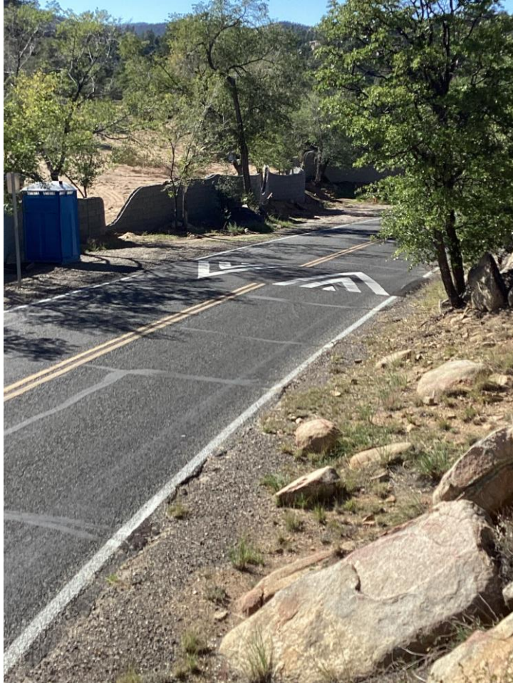
Schemmer Drive Speed Humps