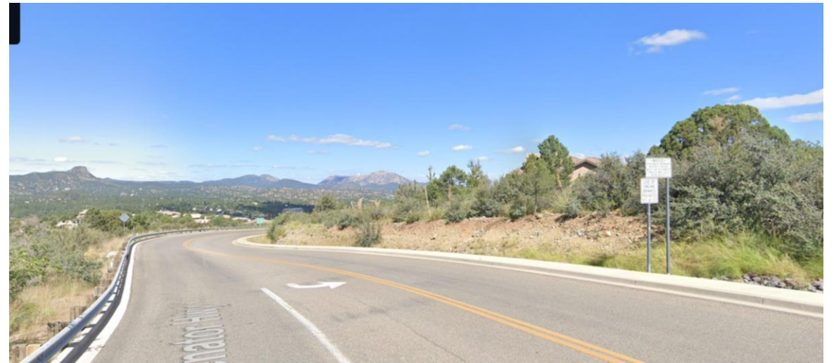
NB Senator Hwy. near Nathan – Engine Braking and Truck Route Signing