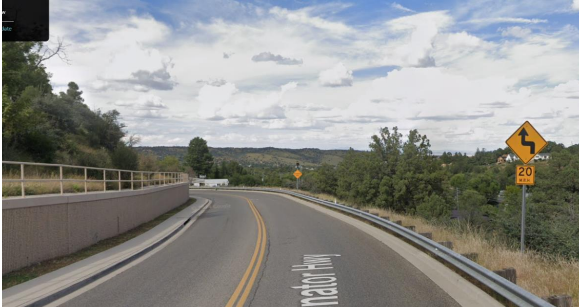
NB Senator Hwy. approaching Mt. Vernon - Warning Signs and Beacon