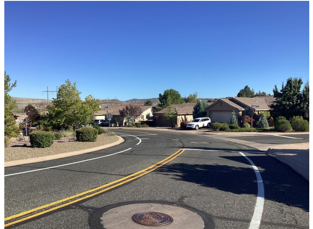
Sarafina Drive @ Sabatina – Needs Crosswalk