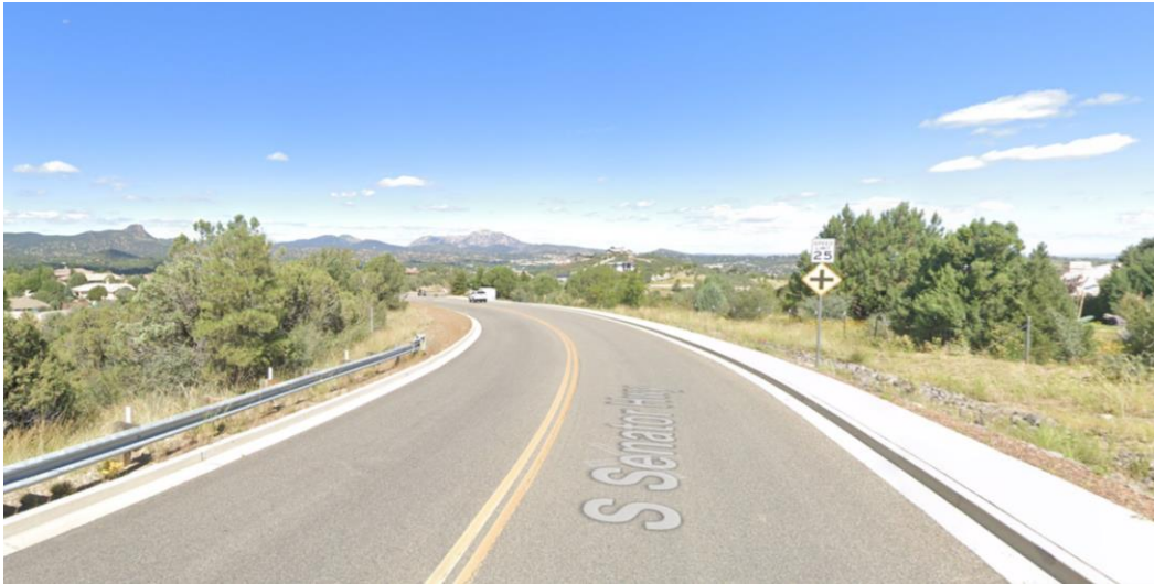
NB Senator Highway before RRFB Installation