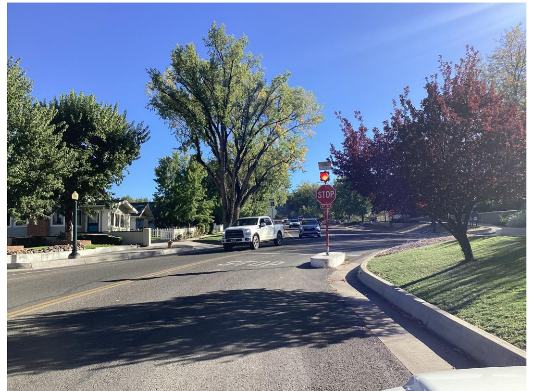
SB S. Mt. Vernon Avenue at Carleton