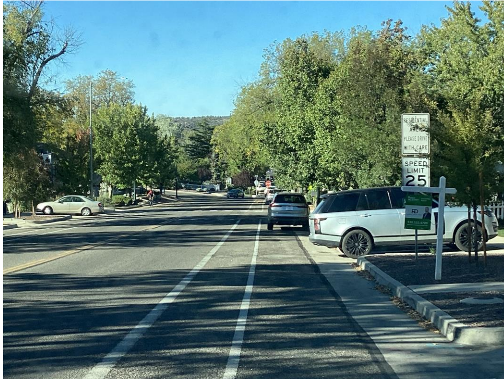
NB S. Mt. Vernon at Oak Street RFBB