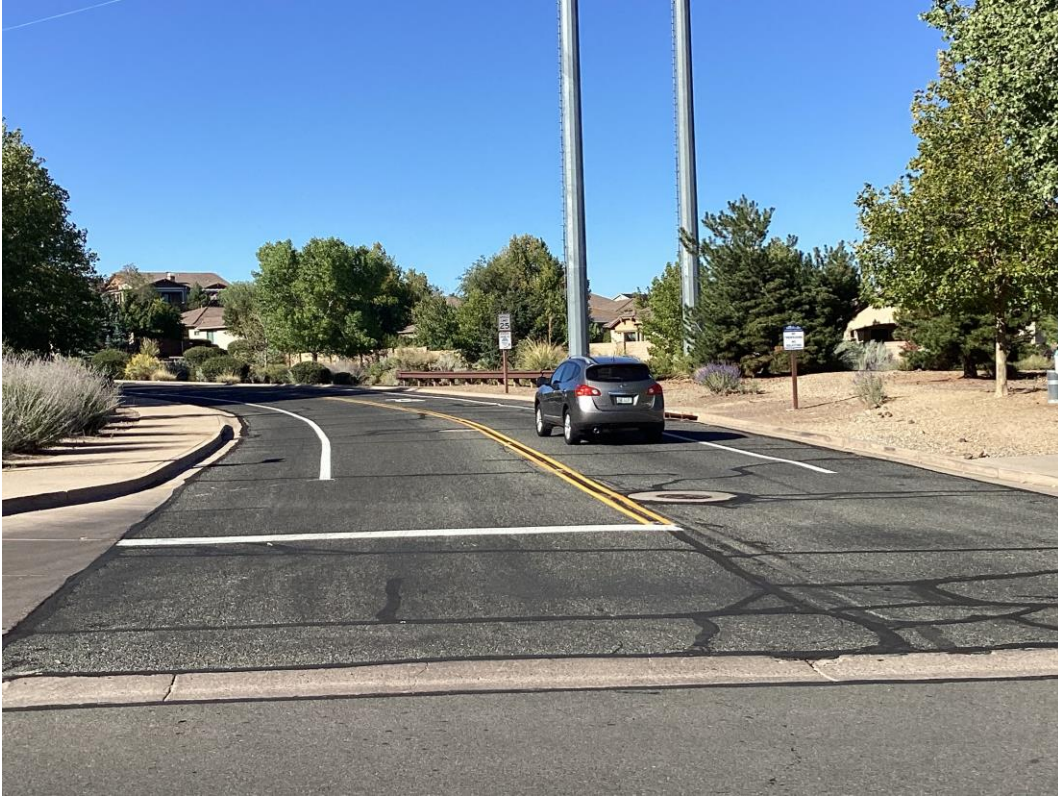
Sarafina Drive @ Smoketree Lane