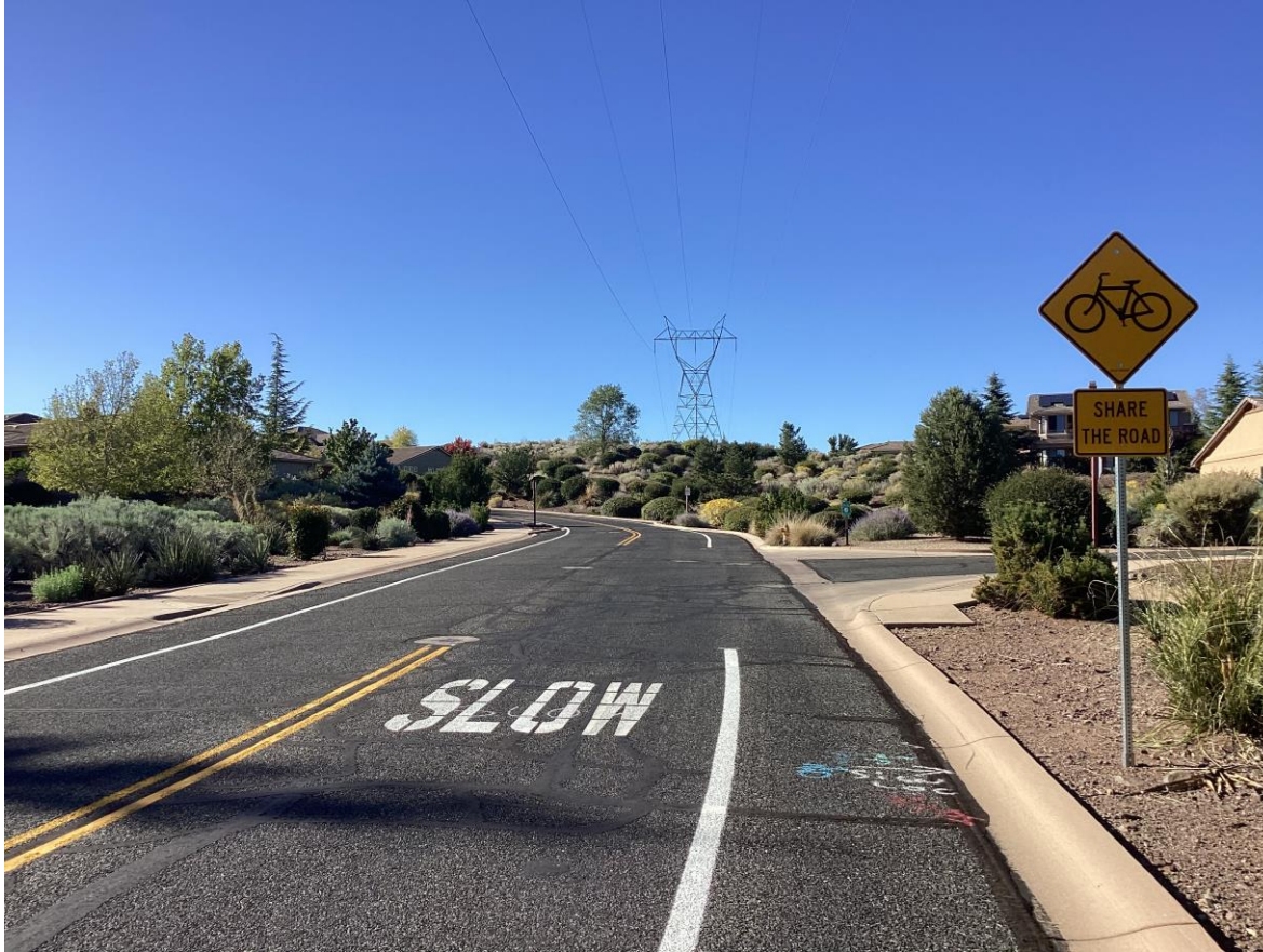
Sarafina Drive Striping Treatment and Signs