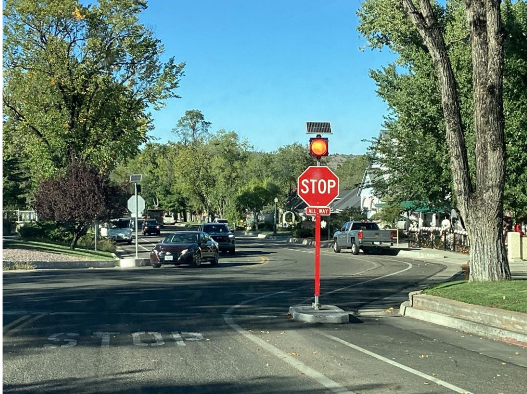
NB S. Mt. Vernon Avenue at Carleton